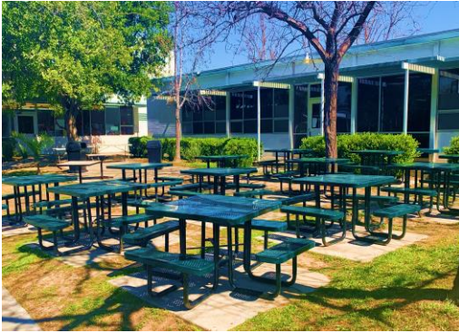
Outdoor Lunch Picnics