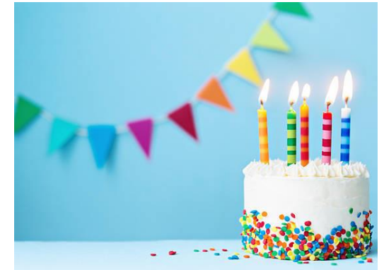
Patient Birthday Celebration